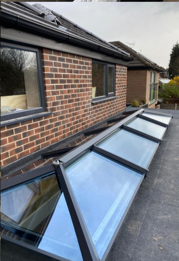
Full Renovation and Extension